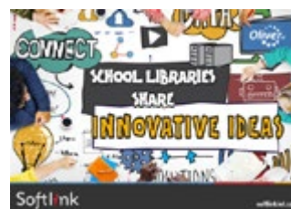
School Libraries Share: Innovative ideas