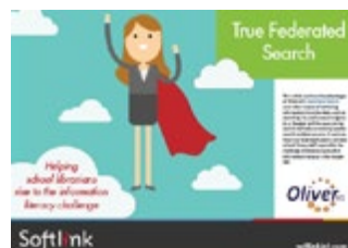
True Federated Search: Helping School librarians rise to the information literacy challenge