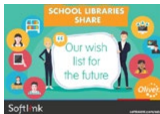
School Libraries Share: Our wish list for the future