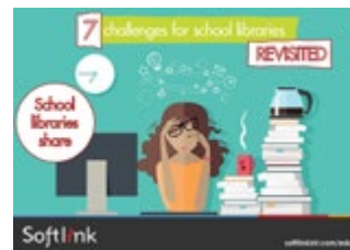
7 Challenges for School Libraries - Revisited