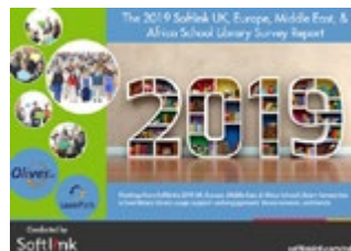
The 2019 Softlink EMEA School Library Survey