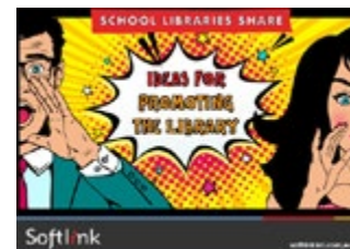
School Libraries Share: Ideas for promoting the library