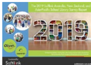
The 2019 Softlink APAC School Library Survey

We have a number of reports and whitepapers available on our website ( softlinkint.com/edu/resources ) including: