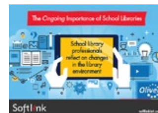
The Ongoing Importance of School Libraries