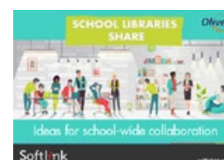
School Libraries Share: Ideas for school-wide collaboration

For even more ideas and resources visit our blog softlinkint.com/blog