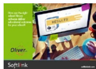
How can the right school library software deliver educational outcomes for your school?