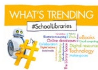
What's Trending #SchoolLibraries 2015