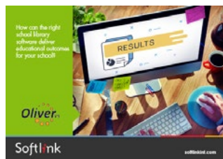
How can the right school library software deliver educational outcomes for your school?