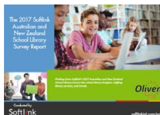
The 2017 Softlink Australian and NZ School Library Survey

We also have a number of reports and whitepapers available on our website ( softlinkint.com/edu/resources ) including: