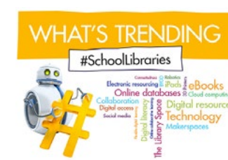
What's Trending #SchoolLibraries