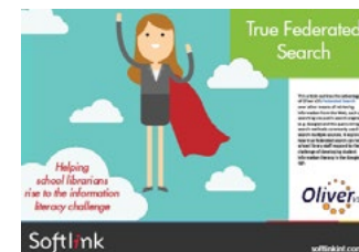
True Federated Search: Helping School librarians rise to the information literacy challenge