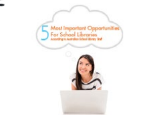
5 Most Important Opportunities For School Librarians