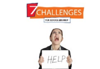
7 Challenges for School Libraries