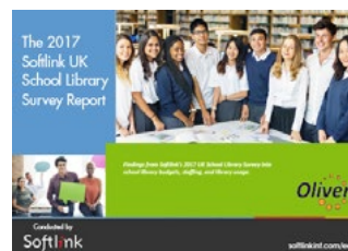
The 2017 Softlink UK School Library Survey