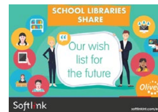
School Libraries Share: Our wish list for the future