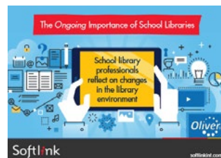
The Ongoing Importance of School Libraries