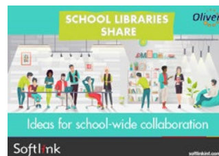
School Libraries Share: Ideas for school-wide collaboration