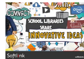
School Libraries Share: Innovative ideas