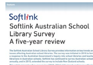
Softlink Australian School library Survey: A five-year review